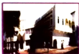
S. K. Porwal College